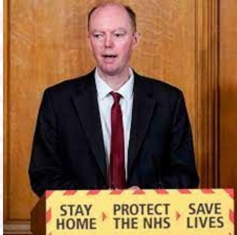
9th March 2020 press conference